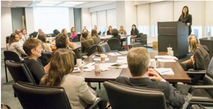
Sanctuary for Families lawyers provide training at STB on how to work with victims of human trafficking.