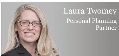
Women's Committee Co-Chair