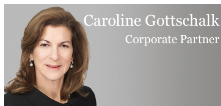
Women's Committee Co-Chair