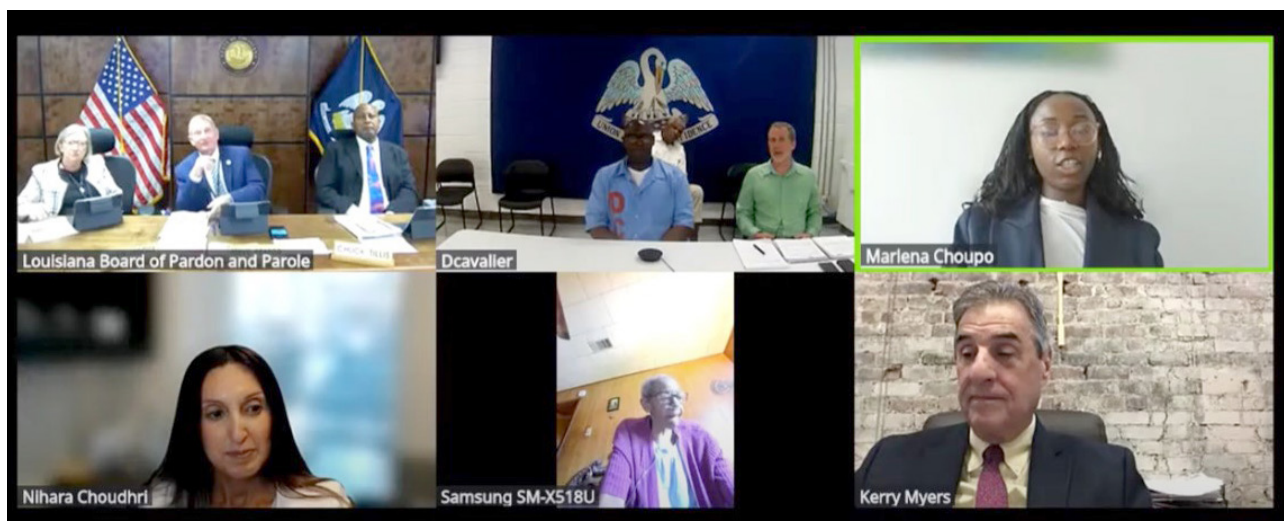
Revocation and parole hearing — July 8, 2025