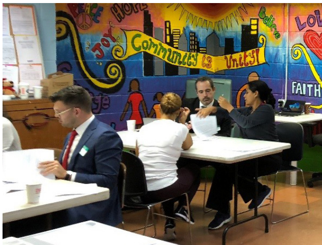
Simpson Thacher and Morgan Stanley volunteers meet clients at Jefferson House Senior Center.