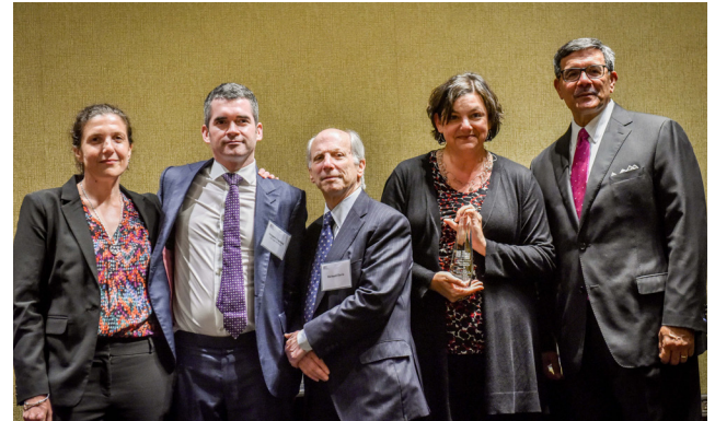
The Legal Aid Society of New York City 2018 Pro Bono Publico Awards