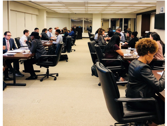
Simpson Thacher and Blackstone attorneys meet women entrepreneurs at the inaugural WE NYC Legal Services Clinic.