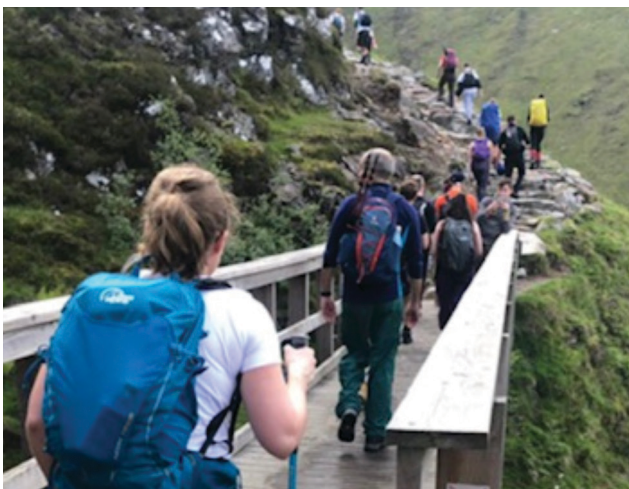
The team heads up one of the three peaks.