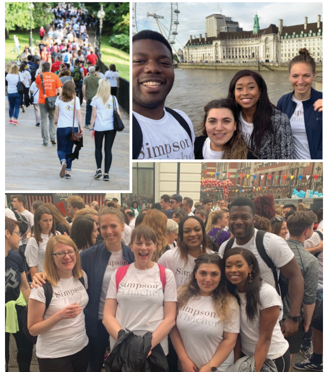
15th Annual London Legal Walk.