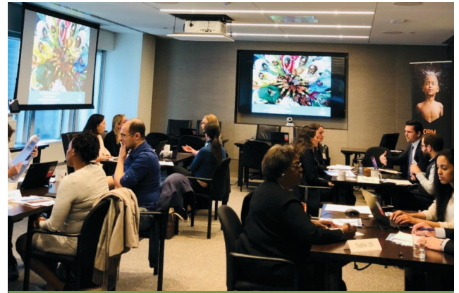
Volunteer lawyers meet with their clients at JPM Clinic.