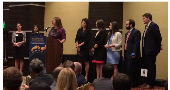
The Simpson Thacher team accepts the Reproductive Justice Award from the ACLU for its work on the Clovis case.