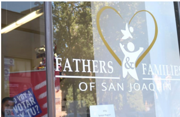
Fathers & Families of San Joaquin County.