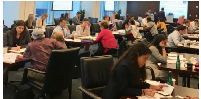
Volunteers meet with clients at the naturalization clinic.