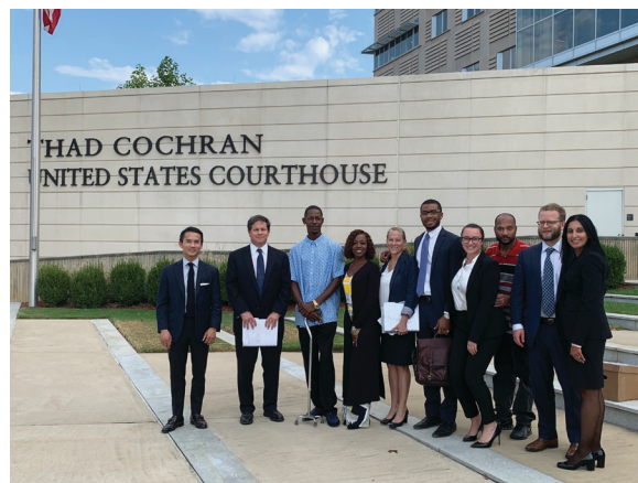
The STB and ACLU team with plaintiffs.