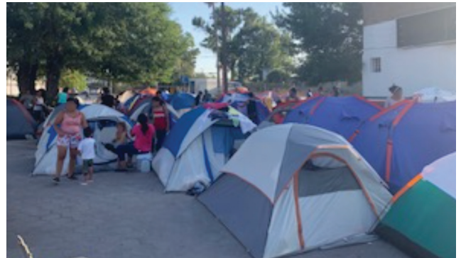
Living quarters of Migrants waiting in Matamoros, Mexico.

The two asylum clients faced dire circumstances in their home countries, including gun violence and beatings by police – one persecuted for his political views, and the other because of his identity as a gay man. Both men also faced incredibly difficult circumstances in the temporary detention centers at the border, where both endured long term stays – despite a purported limitation that no one would be housed in the temporary facility for more than 72 hours. One client spent 38 days in the temporary facility – colloquially known among the detainees as the “dog pound” or the “chicken coop”—and had no access to soap, a toothbrush or a shower throughout that period. The second client contracted mumps, which went untreated and left him deaf in one ear, sterile, and in great pain.