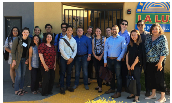
Palo Alto summer associates complete naturalization applications for low-income Sonoma residents.

Twelve summer associates in the Palo Alto office participated in an all-day pro bono clinic by riding the Justice Bus to Sonoma, California to assist fifteen low income clients complete naturalization applications. Through the nonprofit, OneJustice, Simpson Thacher partnered with the International Institute of the Bay Area and La Luz Bilingual Center to assist these clients and brought them one step closer to becoming United States Citizens.